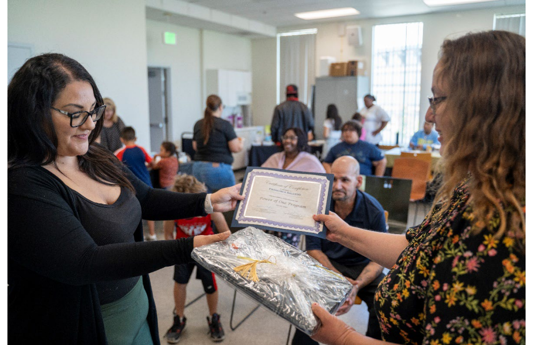
SDHC Achievement Academy Power of One Graduation July 21, 2023