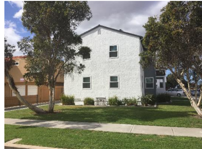
Meade Ave (Windows replacement)