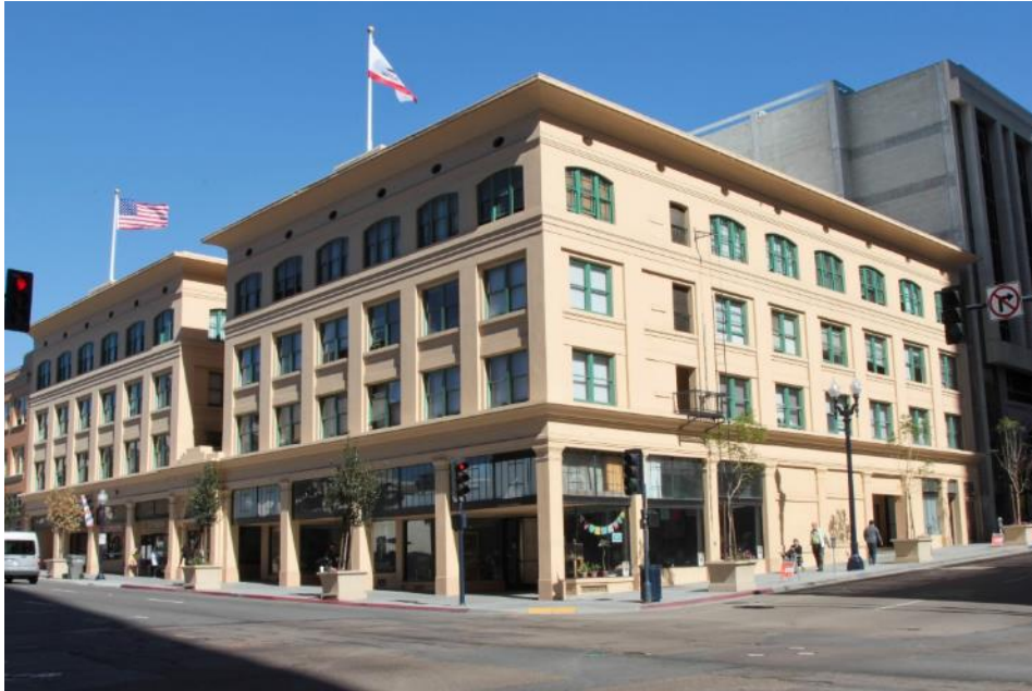
Hotel Sandford 1301 Fifth Avenue Downtown San Diego Council District: 3 130 housing rental units