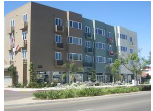
El Cajon Boulevard