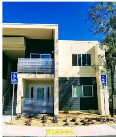
44 th Street