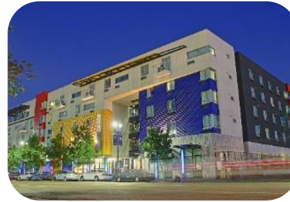
Single-Room Occupancy (SRO)