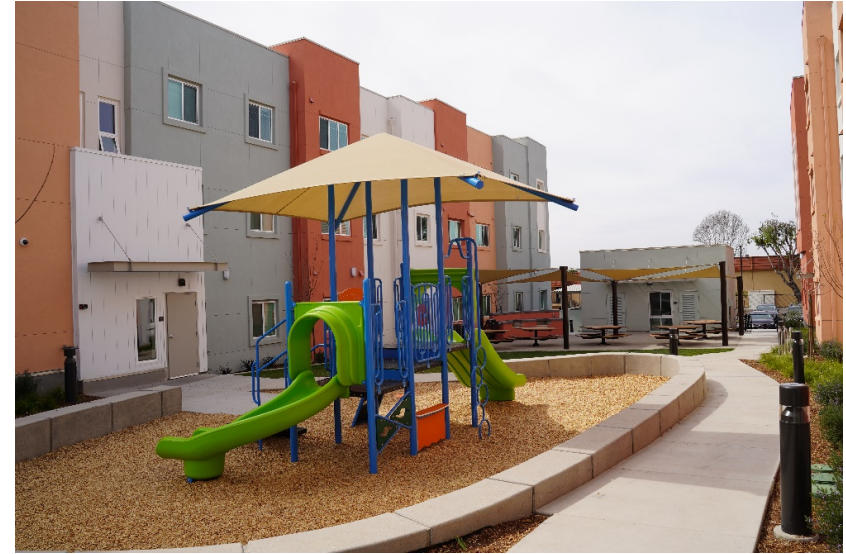
Paseo La Paz 137 affordable units for families San Ysidro $28.6 million Multifamily Housing Revenue Bonds February 27, 2020