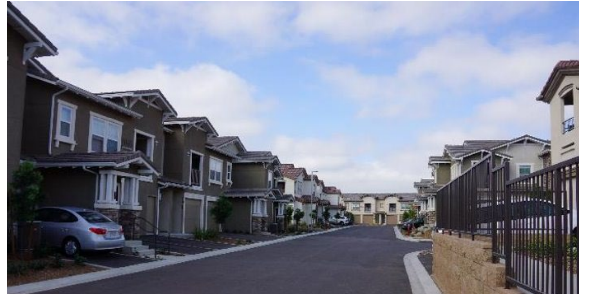
Choice Community: Del Mar Heights Cielo Carmel development – 195 Affordable Units