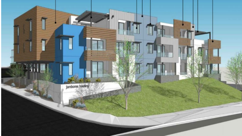
Jamboree Housing's PSH at San Ysidro