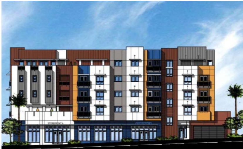
Kingdom Development & MAAC's Ventana al Sur