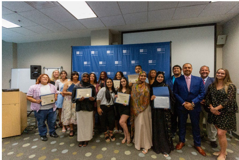
SDHC Achievement Academy’s Healthcare Career Catalyst for Young Adults Program Graduation – August 22, 2024