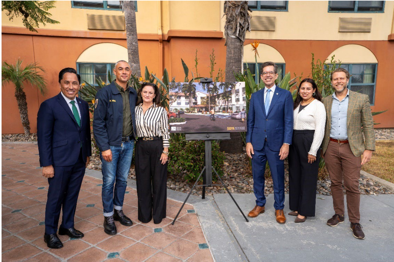
Presidio Palms Construction Kickoff News Conference – October 25, 2024