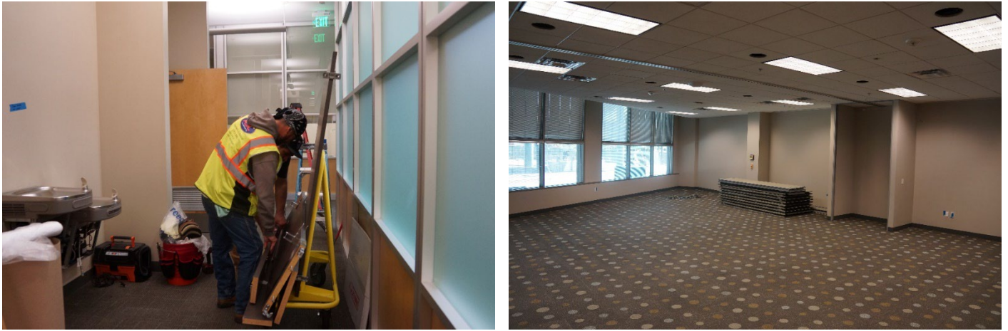
Commencement of Office-Space Conversion into Shelter October 8, 2024

The conversion of this office space into a shelter is anticipated to be completed by the first quarter of 2025.