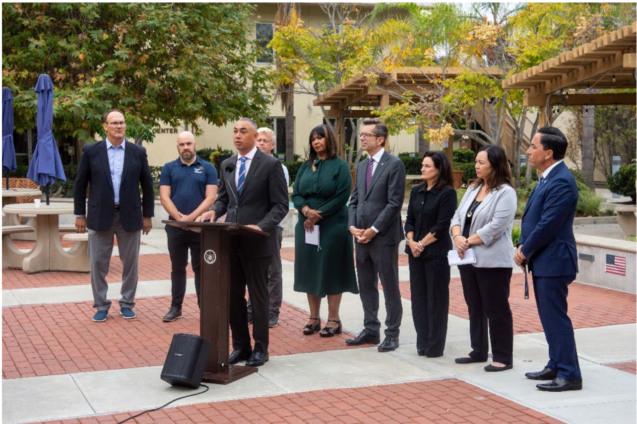
New Homelessness Initiatives News Conference – October 28, 2024

In addition to these new shelter beds, the package of initiatives included a collaboration between SDHC and the Regional Task Force on Homelessness on a homelessness diversion initiative that launched November 1, 2024, to assist up to 150 individuals in the coming months, which will free up shelter beds to assist other experiencing homelessness. Diversion strategies employing flexible financial assistance, shared housing strategies and targeted case management can result in positive outcomes for shelter participants who are experiencing homelessness for the first time or who have existing support systems and the ability to end their homelessness without a long-term subsidy.