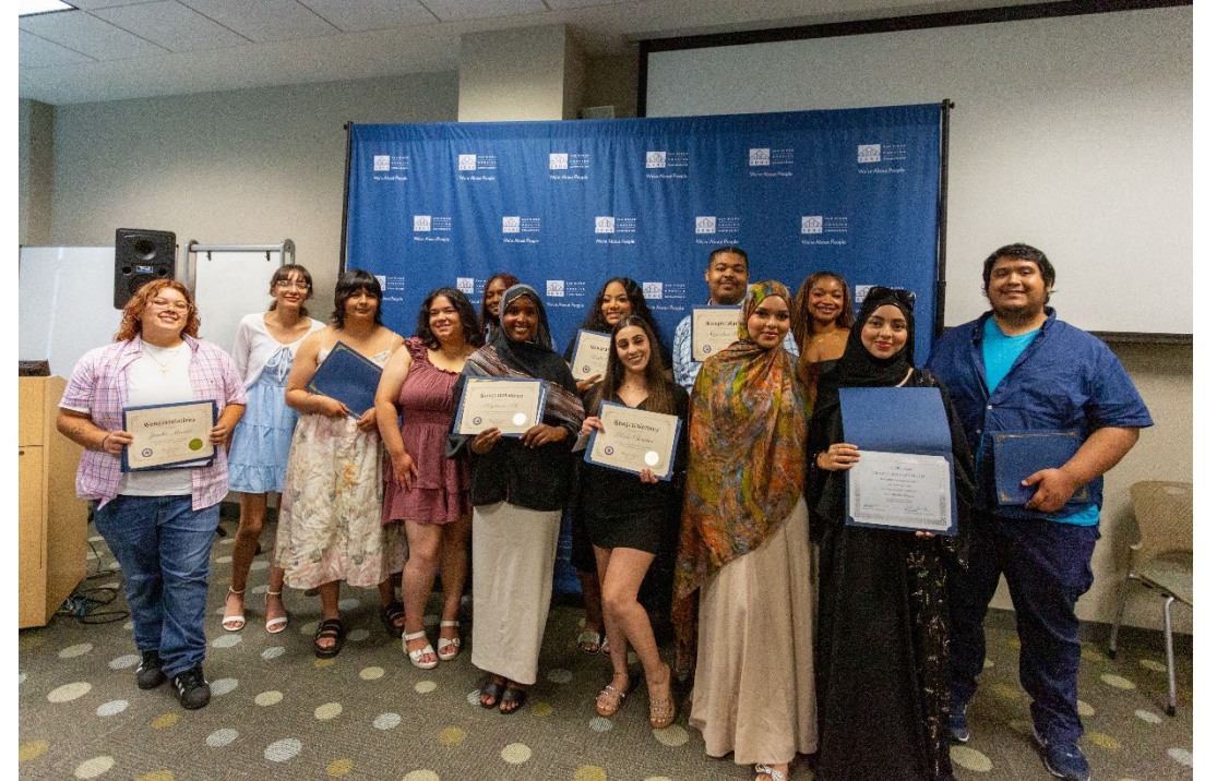
SDHC Achievement Academy Healthcare Career Catalyst for Young Adults Program Graduation August 22, 2024