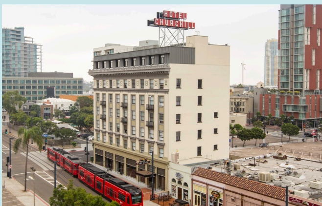
Hotel Churchill – Downtown San Diego