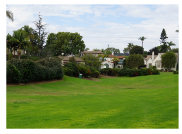
Point Loma Community

SDHC divided City of San Diego (City) ZIP Codes into three groups, each with its own payment standards: