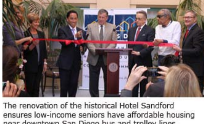
The renovation of the historical Hotel Sandford ensures low-income seniors have affordable housing near downtown San Diego bus and trolley lines.

SDHC's funds for the acquisition and rehabilitation of Hotel Sandford came from its finance plan that followed a September 10, 2007, landmark agreement between SDHC and the U.S. Department of Housing and Urban Development (HUD). HUD transferred ownership of 1,366 public housing units to SDHC.