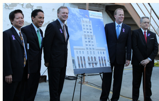
Connections Housing Downtown Construction Kickoff, January 26, 2012

SDHC guided the selection process that included a citizen's panel to review the proposals for the best and most innovative ideas for a year-round center for homeless San Diegans. SDHC also provided a $2 million loan and has committed 89 project-based federal housing vouchers to support the residential program.