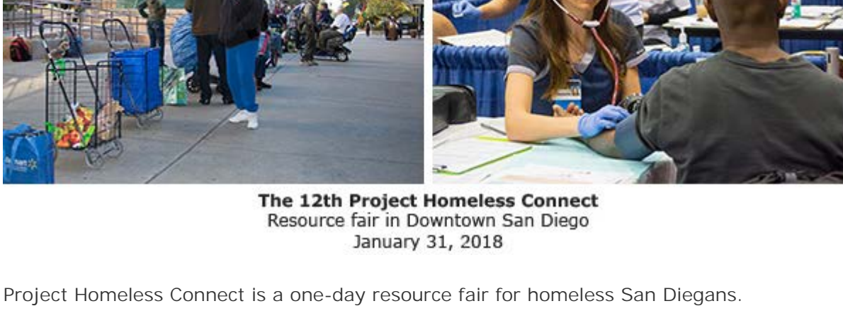
Participants were able to access service providers at 90 booths and receive assistance from more than 400 volunteers.

count are anticipated to be released this spring.