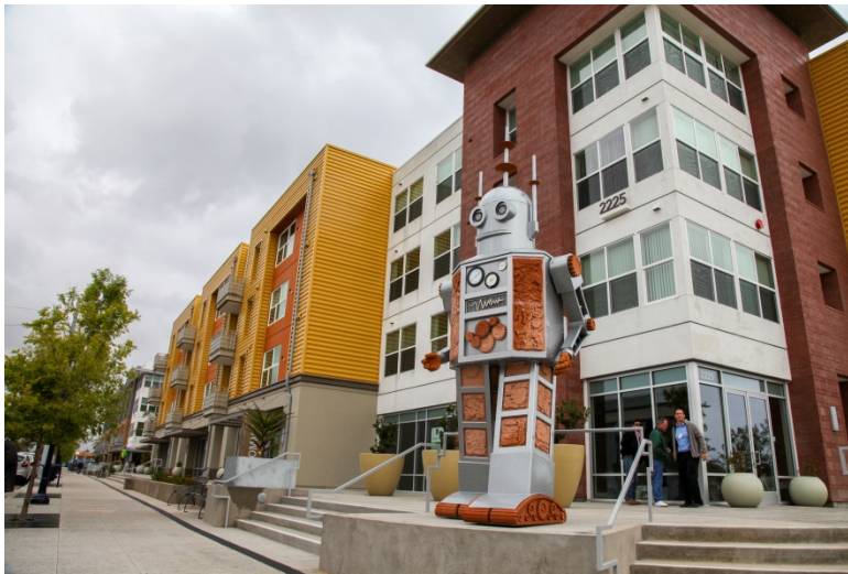
Paseo at COMM22 – San Diego Housing Commission (SDHC) Partnership Logan Heights, City Council District 8 128 affordable housing units and two manager’s units Completed: December 31, 2014

Fiscal Year 2015 (July 1, 2014 – June 30, 2015)