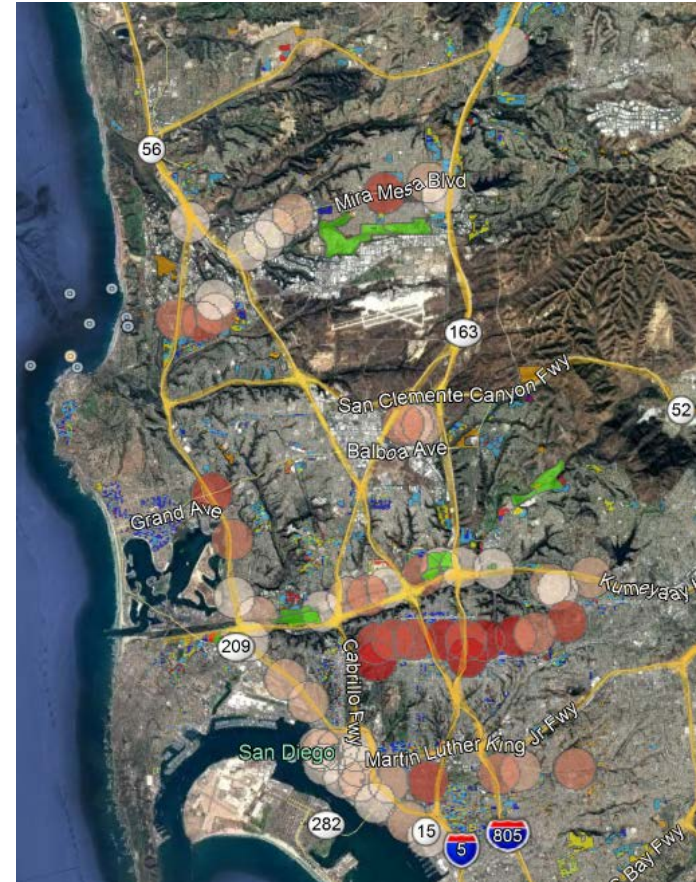
Geo-spatial analysis: Google map that overlays each of five sources on City of San Diego