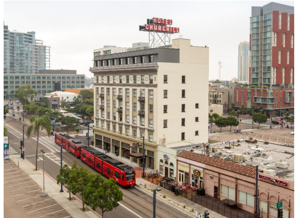
Hotel Churchill Downtown San Diego Grand Reopening September 19, 2016