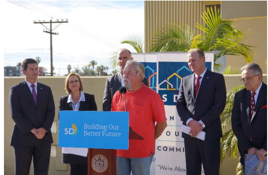
SDHC's 1,000 Homeless Veterans Initiative “Housing Our Heroes” Landlord Outreach News Conference - December 20, 2016