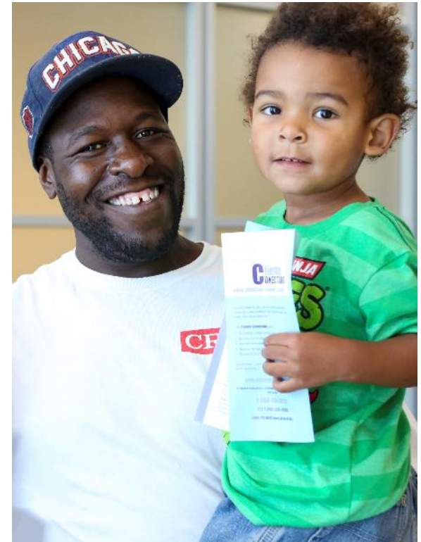
HOUSING FIRST – SAN DIEGO Orientation September 9, 2015