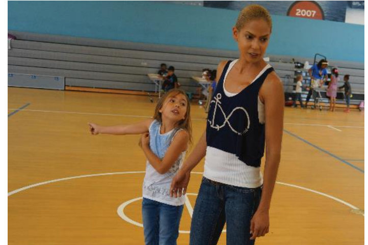
Monarch School Family Receiving Rental Assistance May 19, 2016